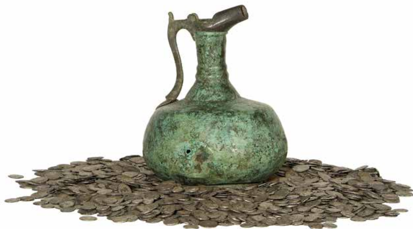
Treasury from Vervoz, Gallo-Roman period

During the 3rd century, Germanic populations, who were being dispelled by the Huns, started to migrate to Western Europe, thus entering the territory of the Roman Empire. The Franks pillaged the territory belonging to Gallia Belgica. These are called barbarian invasions because, in the eyes of the Romans and the Gallo-Romans, anyone who did not speak Latin was viewed as a barbarian. Exhausted after its conquests, and under attack from all sides by barbarian populations from the East and the North, the Roman Empire began to falter. The Franks were originally from Germany. They crossed the Rhine in search of fertile land, engaging in relentless battles and spreading increasingly throughout Belgium and a large part of Gaul itself. They established several independent states, which were governed by the princes of a single dynasty: the Merovingian dynasty. They would birth the first dynasty of French kings. This marked the end of Gallo-Roman Antiquity and the beginning of the Middle Ages.