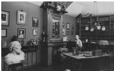
Archive photo of the studio (cf catalogue GC p. 129)

Created in 1884, this artists' circle originally comprised twenty founders from the art scene in Brussels: these included Théo van Rysselberghe, Fernand Khnopff, and James Ensor, among others, as well as influential journalists, writers and art critics. Les XX formed after certain painters were not allowed to participate in the Essor Salon in 1884. "They can exhibit at home!" said one of the jury members. That is exactly what happened. Les XX organised their own exhibition, advocating, above all, for the equality of all artists. There was no more selection jury and each participating artist was allowed to exhibit six paintings. From a stylistic point of view, this group opposed Academic Art and focused on what could be seen. They were interested in nature and the reality of society, which they never idealised. The group broke up approximately ten years later, but the mantle was taken up by "Libre Esthétique" in 1894.