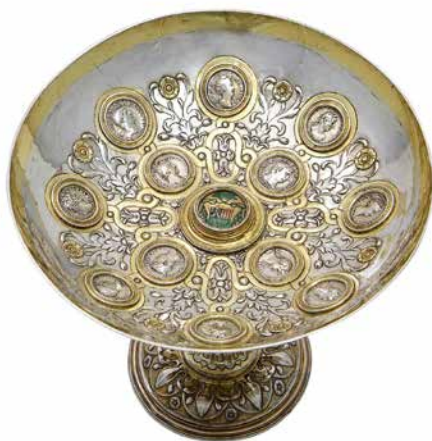
Oranus cup, silver, hallmark of the silver smith GH or HG, Liège, 1564

Established in the second half of the 19th century, humanism refers to an intellectual and artistic trend that sprung up in Italy in the 14th century. It recognises Man as an individual in his own right, with unlimited intellectual potential, a central role in creative endeavours and, above all, an existence that is independent from divine goodness. Understanding reality, the world and how it works gives people the ability to change it. The guiding philosophy of humanism is the desire to bring back the ancient world and to achieve the same level of greatness.