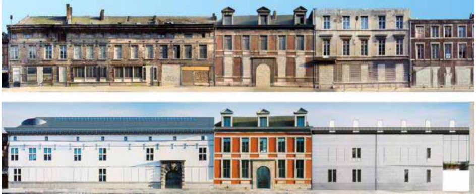
View of the elevation of the museum buildings, before and after Daniel Dethier's additions © www.dethier.be

These historic buildings are connected by modern architectural developments, creating coherent movement and almost imperceptible differences between the diverse constructions from the various periods.