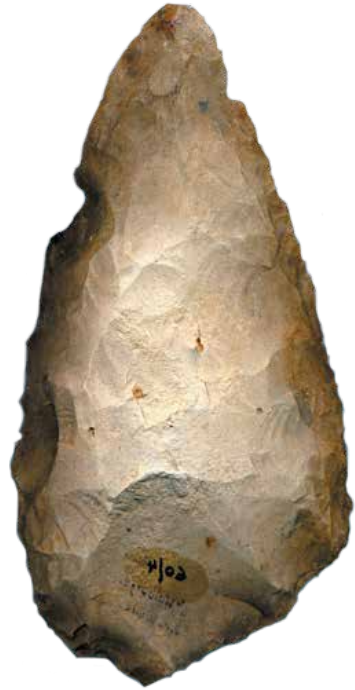
Cordiform biface – Lower Palaeolithic Age (300,000 years ago), Visé, Archaeology department, Grand Curtius

The Palaeolithic Age (from the Greek “paleo”, meaning “old”, and “lithos”, meaning “stone”) was the oldest and longest period of prehistory. It started approximately 2.9 million years ago. The earliest traces of human settlement in Western Europe date back approximately one million years (Homo Erectus). In our region, the earliest traces of human settlement were discovered at Sprimont, at the Belle Roche quarry, and dated back 500,000 years. During this period, people engaged subsistence living, based on hunting, fishing and gathering. This resulted in a nomadic lifestyle.