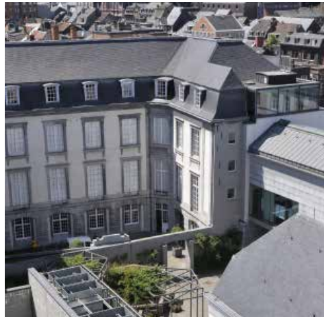
The Hayme de Bomal mansion

Reflecting the Neoclassical architecture of the second half of the 18th century, the Hayme de Bomal mansion is a prime example of French architecture. It follows the tradition of 18th-century Parisian hotels, including the royal apartments on the first floor. Its construction is attributed to Barthélemy Digneffe, the architect, who built it for Jean-Baptiste de Hayme de Bomal, an important Liégeois burgomaster. The mansion was the seat of the department of Ourthe. Napoleon Bonaparte stayed there on two occasions (with his two different wives). It subsequently became the seat of the Dutch administration, before it was taken over by Pierre-Joseph Lemille. He sold it to the City in 1884, so that it could be turned into the Arms Museum.