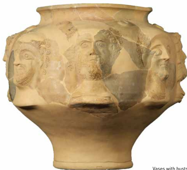
Vases with busts, Gallo-Roman period, Terracotta, Jupille

Today, archaeologists have a clear overview of Jupille during Roman times, thanks to archives and various excavations that have been carried out there. Between the 1st and 3rd century, Jupille was a settlement belonging to the city of Tongeren in Germania Inferior. This settlement was the first stop between Tongeren and Trier. The strategic positioning of this settlement was therefore beneficial to its development. Today, we know that Jupille was home to two craft industries: on the one hand, metallurgy, which is attested to by the discovery of forges, and, on the other hand, pottery, which can be seen in the discovery of kilns and the remains of ceramic pieces. The importance of the city is also evidenced by the presence of a temple dedicated to Apollo. This is located along the main road of the settlement.