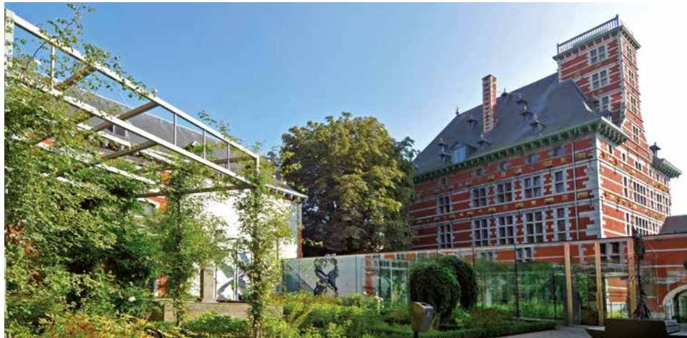
View of Curtius Palace from the courtyard of the residence