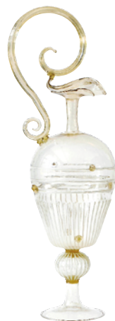
Ewer, second half of the 16th century – early 17th century, Catalonia, Spain © Grand Curtius, City of Liège

In the early 11th century, Venice became one of the leading maritime and commercial powers. The city also became a key hub for glass in Europe, thanks to the assimilation of glass-making techniques from the East. In 1291, the glass-making workshops were moved to the nearby island of Murano, as a result of the nuisance caused by the many kilns in the city. A strict policy of protectionism was put in place: glass makers were threatened with imprisonment and even death if they revealed manufacturing secrets. The success of Venetian glass was the result of technical and decorative innovations employed by the artisans. In approximately 1450, they invented cristallo , a clear, colourless glass. In the 16th century, they developed the filigree decorating technique. This involved adding streaks of white or coloured glass in the molten glass mixture. These streaks may form a pattern of parallel, spiral or overlapping lines. The renown experienced by Venetian glass makers led to a variety of imitations across Europe, which would be referred to as "Venetian-style".