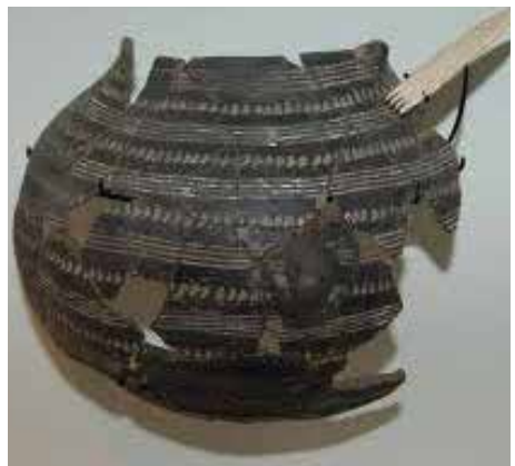
Pyriform vase, Early Neolithic Age, [4,900–500 years ago], found at Place Saint-Lambert in Liège, Grand Curtius

The Neolithic Age (from the Greek "neo", meaning "new", and "lithos" meaning "stone"), is the most recent portion of prehistory. During this period, stone is cut and also polished. This period of civilisation is characterised by major social and technical changes, which are linked to groups shifting towards a production-based economy. This is based on agriculture and breeding and most often leads to people leading a sedentary lifestyle. As a result, people are no longer dependant on nature, but rather have a real influence over their environment due to their ability to produce resources.