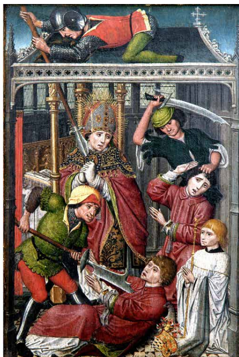
Palude diptych, oil on panels, Liège, post-1488, Grand Curtius