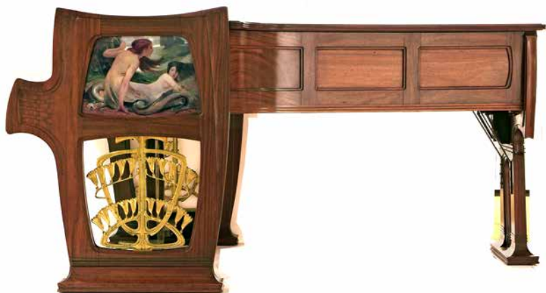
Gustave Serrurier-Bovy (furniture), Emile Berchmans (painter), Maison Pleyel (piano), piano and sheet music set, 1902, Liège-Paris

in Cointe, Cheyrelle castle in Dienne, Auvergne, Villa Ortiz Basualdo in Mar del Plata, Argentine). The piano and billiards table are now stored at the Grand Curtius. The shape of the piano differs from that of classic grand pianos. The furnishings for this Pleyel piano were designed in an architectural style. This makes the structure of the furniture highly intuitive. This focus on intuitive furniture and simple composition principles are typical of Serrurier-Bovy and his work. The style of the piano is distinguished by the dominant curved line, which aligns with Art Nouveau trends. The traditional legs were replaced side sections, two of which comprise sculpted bronze panels. These were created by Oscar Berchmans and feature depictions of magnolia flowers. The upper panel was painted by his brother, Emile Berchmans. These paintings depict scenes from mythology that have musical component: a faun playing the flute in a forest, sirens with their hair blowing in the wind and Orpheus playing the lyre.