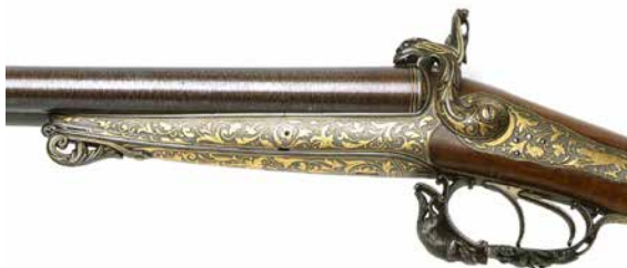
Liège rifle at the Exposition Universelle in Paris in 1867, 1865, Liège