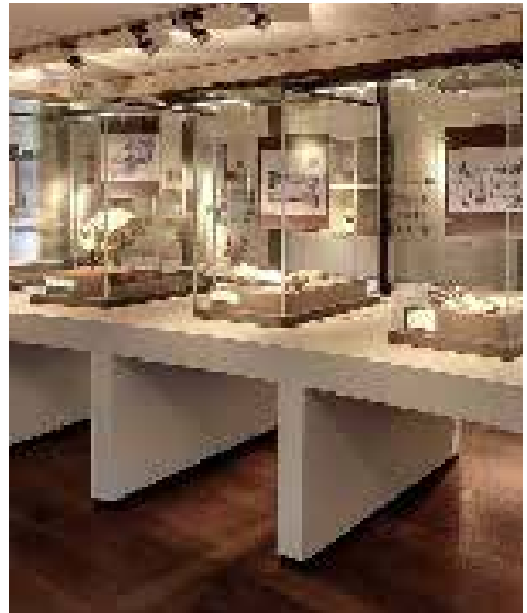
Overview of the Archaeology department

The Liège Archaeological Institute (IAL) is an association founded in 1850. It aims to research, collect and preserve artworks and archaeological monuments found in the province of Liège. It comprised scholars, archaeologists, historians, architects and more from Liège.