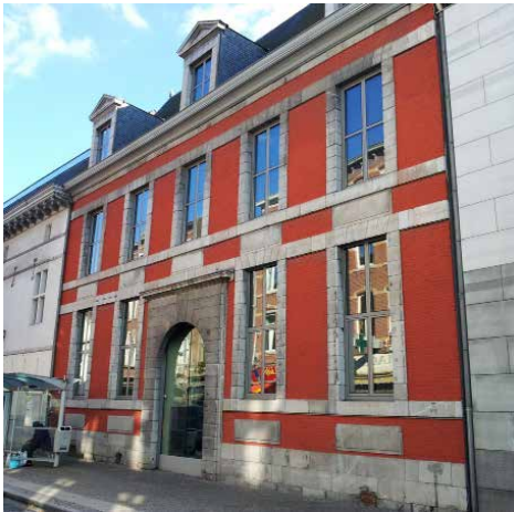
The Brahy mansion

Originally, these two mansions were a single building, which was constructed during the second half of the 17th century. It was known as the Hôtel de Haxhe and was constructed by Conrad de Haxhe, who was burgomaster of Liège in 1673. The brick and limestone architecture with lintels showcases an evolution in architectural styles, particularly in the shift from mullioned windows to large bay windows. Around 1770, the mansion was divided into two parts, which would be developed independently of one other by various owners: the street-facing (Brah) part and the main (Wilde) part in the south. In the 20th century, the building was taken over by the City and used as a warehouse. At the museum's inception, plans were made to demolish these two buildings, but, in the end, they were restored and integrated into the general design as the museum reception and cafeteria areas.