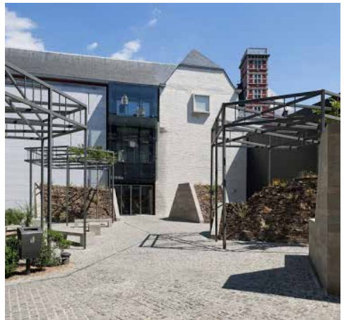
Main courtyard of the Grand Curtius

The museum's exterior courtyards were also designed by a landscape architect: Erik Dhont. In the main courtyard, he created abstract volumes using bricks of different shapes and sizes. Their position in the landscape suggests potential itineraries for visitors. The bricks used for the fountains were recovered from houses that were demolished when constructing the contemporary buildings.