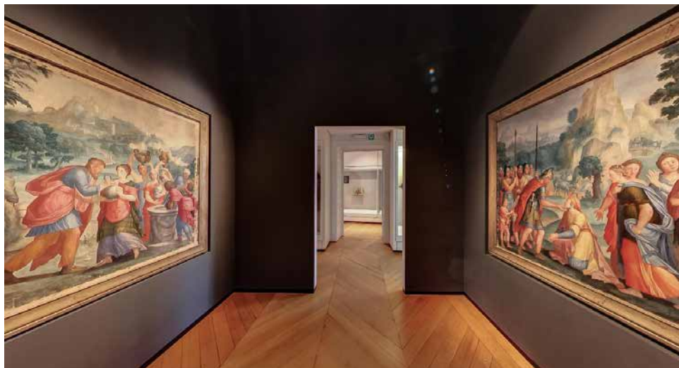
Lambert Lombard, Cycle of virtuous women, approximately 1530–1535, Liège, Fine Arts of Liège

The Renaissance – which began in Florence – refers to a period of “renewal” that spanned the 15th and 16th centuries, depending on the region. In Italy, the “Early Renaissance” or “Quattrocento” refers to the 15th century. The “High Renaissance” (also known as the “Cinquecento”) spread across Europe in the 16th century. Seen as a shift away from the Middle Ages, the Renaissance was inspired by Greco-Roman antiquity, which was seen as a socio-cultural model to which to aspire.