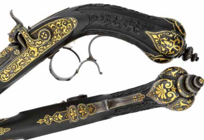
Geerinckx flintlock gun, 1889

Thanks to developments in chemistry in the 18th century, the explosive properties of mercury fulminate and silver were discovered. As a result, the black powder that was used for firearms was replaced by fulminates at the beginning of the 19th century. In terms of mechanics, the dog was replaced by a hammer that strikes a piston and the primer.