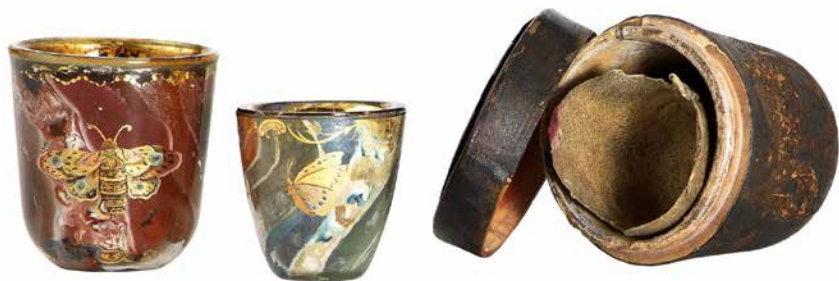
Travel goblets, 18th century, Bohemia

The 18th century was the golden age for Bohemia glass (today known as Czechia), overtaking English crystal and, in particular, Venetian glass, which had previously dominated glass production in Europe. Bohemia made its mark by focusing on international trade and regulations that focused on internal protectionism. The glass workshops developed very pure glass, which was obtained with high-quality quartz and potash. Lime was added to this. The discovery of new bleaching process that involved the use of manganese dioxide – known as "glass makers' soap" – made it possible to produce clearer glass. When working with this thicker material during production, artisans demonstrated their expertise with two decorating techniques: deeper cuts and wheel engraving. The latter, which was discovered by Caspar Lehman in approximately 1600, an engraver in the court of Rudolf II in Prague, refined the decorating process for coats of arms, foliage scroll work and flowers, as well as genre and religious scenes. Even today, Bohemia glass remains the gold standard in the collective consciousness.