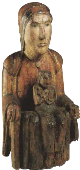
Seat of Wisdom, also known as the Virgin of Évegnée, multi-coloured wood, Mosan region, approximately 1060, Grand Curtius

This Madonna and Child is a Seat of Wisdom ( Sedes Sapientiae in Latin). The seated virgin becomes one with her seat. She is materialising the seat of wisdom that is made incarnate by her son. She holds an apple in one of her hands. The Virgin is the “New Eve”, who atones for original sin by giving birth to the son of God. The Child more closely resembles a miniature adult. He is giving a Latin-style blessing with one hand (the last two fingers are bent); his other hand holds a book. There is no display of affection between mother and son. Instead, she seems quite serious. The select traces of polychromy are original. The craftsmanship is archaic and almost schematic in nature. The reliefs are simplified to the most basic expression, particularly in the depiction of the anatomy and clothing. The work, which was damaged by fire, is now partially amputated. This is one of the oldest Mosan Seats of Wisdom.