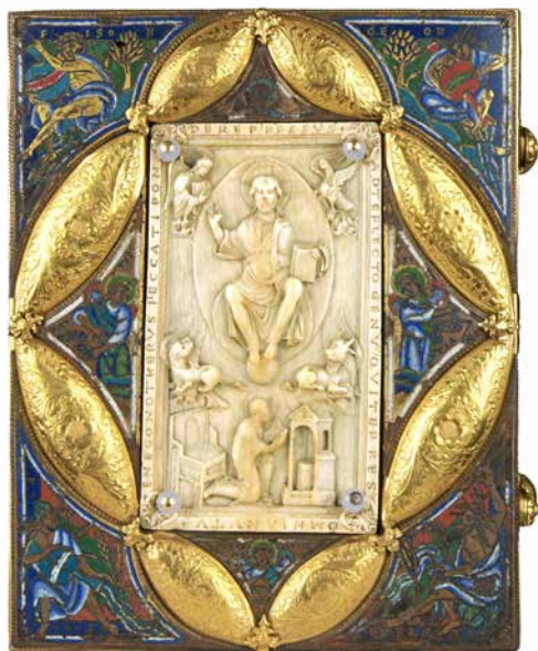
so-called Notger gospel book, manuscript: Reims (?), approximately 930; ivory: 11th century; enamel: approximately 1160; engraved plaques: 15th century, Grand Curtius

Between 972 and 1008, the diocese of Liège was overseen by Bishop Notger. The German emperor, Otto II, gave him the title of prince-bishop and sent him to this tumultuous region, which was coveted by the King of France. Liège became an ecclesiastical principality in which Notger had complete control, in terms of both civil and religious matters. Rich and powerful, Notger launched significant works projects: he built a city wall, within which he built seven collegiate churches and two abbeys, as well as the imposing Cathedral of Our Lady and St. Lambert. This was built beside his new episcopal palace, which served as a symbol of his religious and political power.