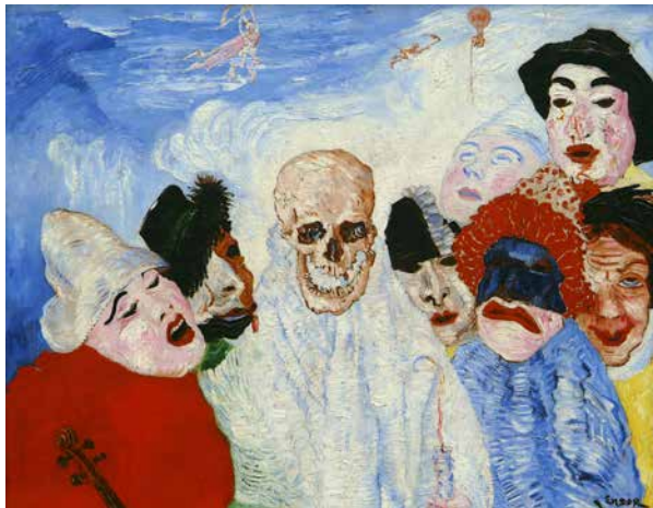
James Ensor, La mort et les masques , 1897