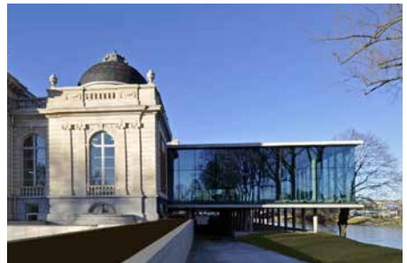
Rudy RICCIOTTI, Contemporary extension, 2010-2015