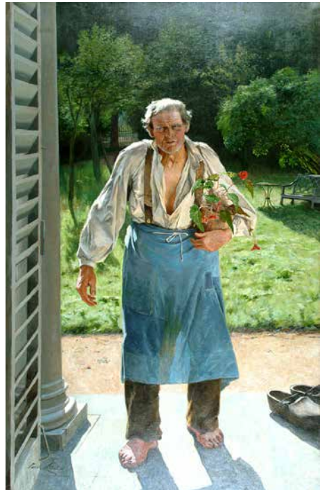
Emile Claus, Le vieux jardinier , vers 1886 © Ville de Liège

Luminism was a Belgian pictorial trend influenced by French Impressionism and Neo-Impressionism, the leading figure of which was Émile Claus (1849–1924). Its central hub was in Flanders, most notably the region around the Lys river, including the village of Laethem-Saint-Martin. Plays on contrast and a bright palette applied with small strokes recreate the clearest beams of light.