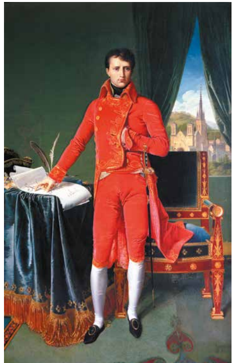
Jean-Auguste Dominique Ingres, Napoléon Bonaparte, premier Consul , 1803 © Ville de Liège

also depicted the important events of their lifetimes, such as the Napoleonic wars or the revolution of 1830, each choosing episodes that resonated with their own sensibilities.