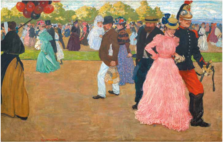
Henri Evenepoel, La promenade du dimanche au Bois de Boulogne , 1899.