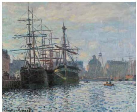
Claude Monet, Le bassin du commerce, Le Havre , 1874

Created in 1884, this artist's circle initially comprised twenty founding members from the art scene in Brussels; these included, among others, Théo van Rysselberghe, Fernand Khnopff and James Ensor, as well as several influential journalists, writers and art critics. The Les XX group was formed after two or three painters were refused entry to the Brussels Salon in 1884. "They can exhibit in their own space," said one of the jury members. That's exactly what they did. The "Les XX" group organised its own exhibition, above all serving as proponents for equality amongst artists. There was no longer a jury for making selections and each participating artist could exhibit six canvases. From a stylistic point of view, this group reacted as one against academicism and was based around what could be seen, by focusing on nature and social situations in a non-idealised manner. The group broke up about ten years later, but its successor was established with the "Libre Esthétique" group in 1894.