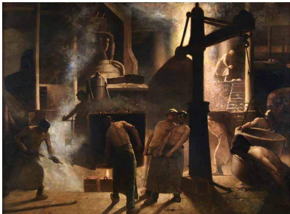
Constantin Meunier, La coulée à Seraing, vers 1880

In 1878, Constantin Meunier visited the Cockerill factory in Seraing and observed steel casting. He was struck by the “tragic and savage beauty” of the factory, which he depicted in several preparatory sketches. One year later, the Belgian naturalist writer Camille Lemonnier asked him to illustrate his book, La Belgique (Belgium). Meunier took this opportunity to make use of his drawings. As a result, he painted La coulée à Seraing (The Casting at Seraing) in 1880. This piece testified to the technological advances happening in the steel-working field. The Cockerill factory adopted the “Bessemer” process for transforming cast iron into steel in 1863. This system allowed a large amount of steel to be produced at a low cost, by injecting air into the retort containing the molten metal. The steel obtained was cast in bullion-shaped moulds. It is this step that is depicted by La coulée à Seraing (The Casting at Seraing): two workers are releasing the valve on the retort, allowing the steel into the mould, while, on the right-hand side, another worker is cooling the mixture by watering it. The artist adopts a colour palette that captures the sweltering atmosphere of the factory. The large format and chiaroscuro contrasts of the light help to emphasise the tensed muscles of the workers’ bodies and the ruggedness of the work. This piece reflects the artist’s social engagement and sensitivity to the working condition, elevating the latter figure to a contemporary hero figure.